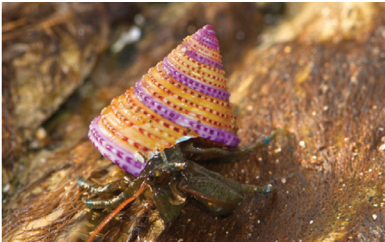
blue-banded hermit crab (Jerry Kirkhart)