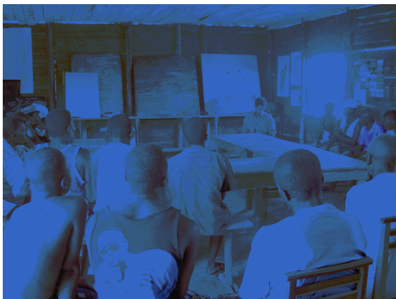
Fig. 9, workshop with local fishermen discussing feasibility of and attitudes towards the proposed marine protected area.

These exchanges give the community an opportunity to decide the management strategy of the MPA. Following numerous discussions over recent months, the Andavadoaka community is in strong favour of the implementation of the no-take zone. During traditional ecological knowledge meetings fishermen have frequently cited the MPA as an important tool for stopping the alarming decline in the quality of the marine environment of Andavadoaka.