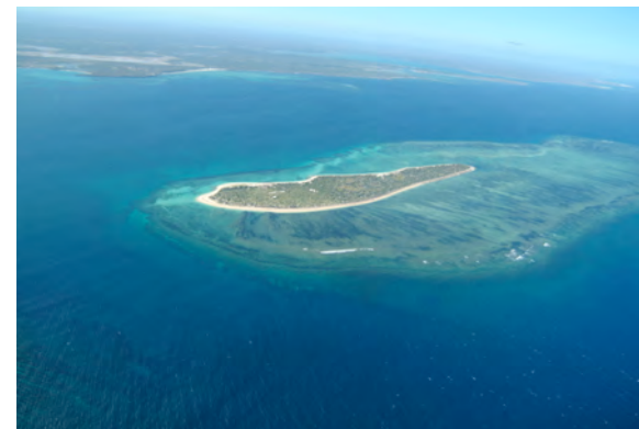
Fig. 5, aerial photo of Nosy Hao island, 2km west of Andavadoaka, showing extent of fringing reefs. Certain areas of the island's reefs will form part of the region's marine protected area.

community can work towards to develop sustainable local environmental management plans for Andavadoaka's unique marine and coastal environment. These plans focus on improving the quality of life of the local communities who depend on the area's marine resources while maintaining the biological diversity and productivity of the reefs.