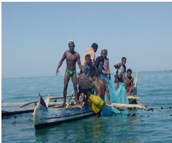
Fig. 2, artisanal fishermen catch the endangered green sea turtle, Chelonia mydas, Andavadoaka, Madagascar.

Despite these imminent anthropogenic and natural threats, marine and coastal habitats in Madagascar have historically taken a back seat to terrestrial conservation. Recently however, marine and coastal conservation has received an increasing amount of attention as a principal focus of the third phase of Madagascar's environmental plan (EP3), following President Marc Ravalomanana's commitment to create 6 million hectares of protected areas as part of the Durban Initiative.