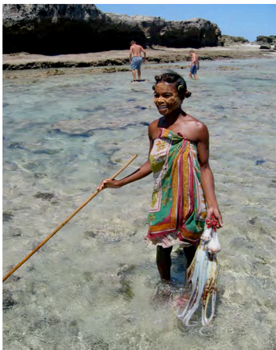
Fig. 11, A Local fisherwomen with her catch of Octopus cyanea.

large (and more valuable in terms of price per gram) octopus from reef flat fishing grounds once a closed area is re-opened. Soon after one closed area is opened to fishing, another is closed to allow the octopus on the second flat to settle, grow, reproduce, and reach larger (and more commercially valuable) sizes.