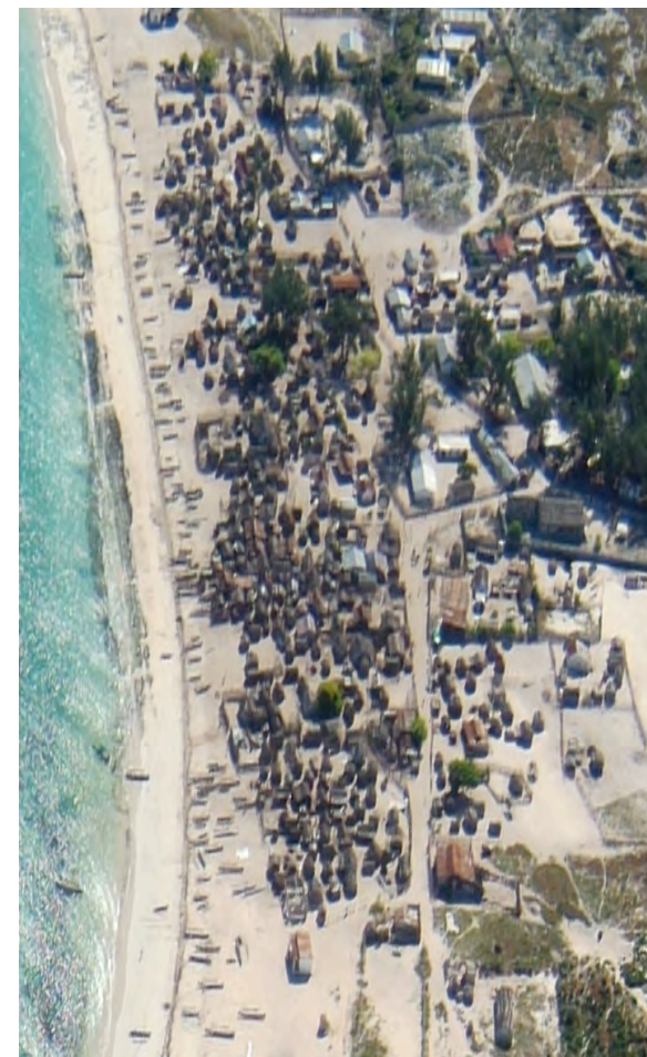
Fig. 3, Andavadoaka, Vezo fishing village, southwestern Madagascar.

In addition to this new market force, a recent growth in visitor numbers to the area's two hotels has increased Andavadoaka's reputation for coastal tourism.