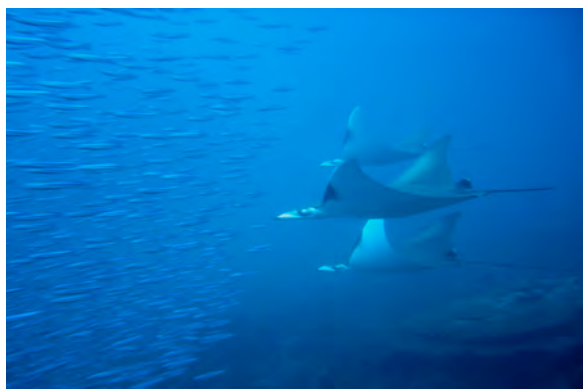
Fig. 6, Trio of Mobula japonica gliding over transect site on Recruitment Reef, Andavadoaka, within the zone of the proposed MPA.

Elsewhere, MPAs have been shown to give rise to higher fish biomass, higher fish density, larger carnivorous fish and invertebrates, increased fish larval supplies, and higher biodiversity than fished areas. In addition, well-managed reef-based tourism is a non-extractive industry providing employment for locals, who might otherwise resort to destructive fishing, an activity that yields a much smaller economic gain than tourism.