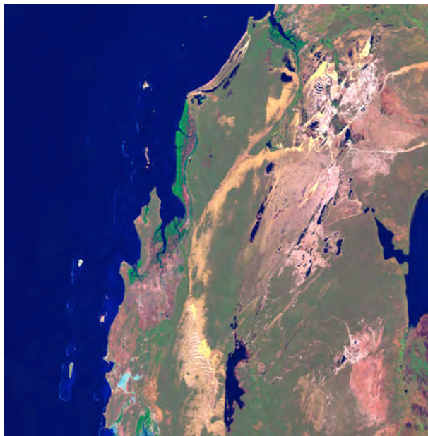
Fig. 4, satellite image of Andavadoaka and Morombe region, showing the network of offshore islands.

Considering current potential threats to the region's reefs, and as a priority within the framework of the National Strategy for the Conservation of Biodiversity in Madagascar, it was considered critical that data be gathered for use in local environmental management plans. Because of this, Blue Ventures Conservation, a UK-based marine conservation organisation working in collaboration with Madagascar's national marine research institute (the Institut Halieutique et des Sciences Marines - IHSM), recently established a three-year marine research program in Andavadoaka.