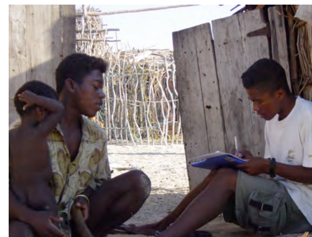
Fig. 8, IHSM student carrying out interview with fisherman survey in Andavadoaka village.

partnership with ongoing guidance on socio-economic and ecotourism-related research activities.