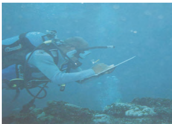
Fig. 7, IHSM scientist undertaking benthic coral reef survey, Andavadoaka.

Income for the project will continue to be generated through Blue Ventures' existing research volunteer programme, as well as through fees charged to tourists visiting the MPA. This revenue is being used to manage the project and train local MPA guides and managers, as well as to further develop the capacity-building and education programmes initiated by the partnership.