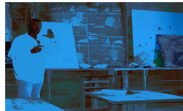
Fig. 12, presentation on proposed marine protected area by village president, Andavadoaka.

acquired and developed in the Andavadoaka project elsewhere in Madagascar.