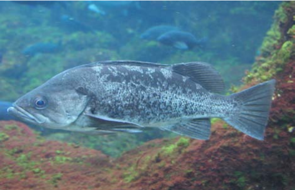
black rockfish (Steve Lonhart)