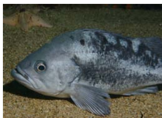
black rockfish (Chad King)