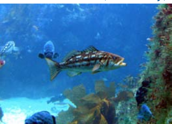
kelp bass