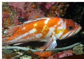
copper rockfish (Chad King)