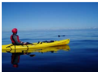
kayaking (Claire Fackler)