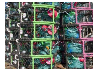
crab pots (Bart Selby)