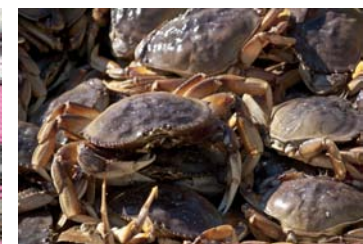
dungeness crab (Bart Selby)