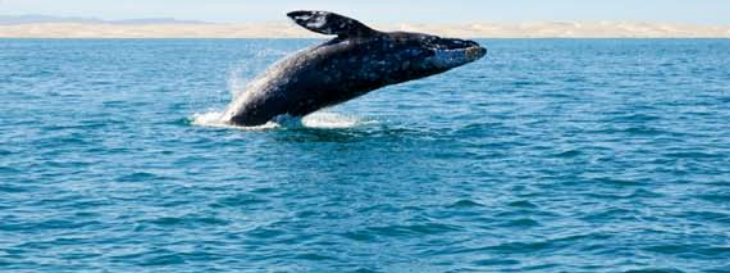
Image above: Bodega Head Beach below: gray whale breaching

California Department of Fish and Wildlife, Marine Region