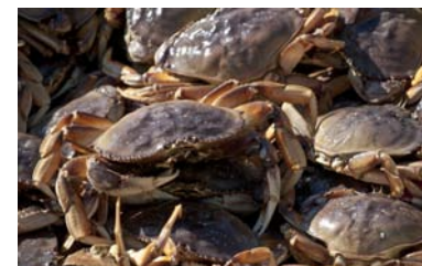
dungeness crab (Bart Selby)