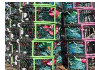
crab pots (Bart Selby)