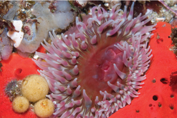
stubby rose anemone (Chad King)