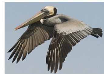
brown pelican