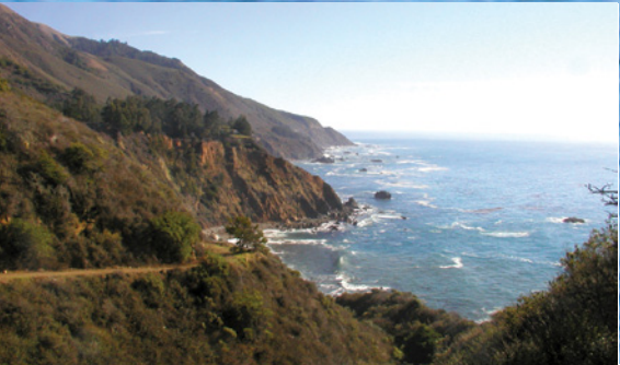
Big Sur coastline (Steve Lonhart)