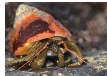
hermit crab