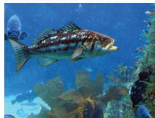
kelp bass