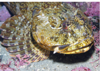
cabezon

The Ohlone, Esselen and Salinan, lived along this stretch of coastline leading a nomadic, hunter-gatherer existence for thousands of years. Here, they took advantage of the abundance of marine life harvesting rich stocks of mussels, abalone and fishes. To the Europeans, Point Sur was recognized as a navigation hazard, as many shipwrecked captains and even airship pilots can attest. Off the coast of Point Sur SMR, is the U.S.S. Macon, a 785-foot dirigible, which was lost offshore in 1935. The Macon was added to the National Register of Historic Places in 2010. Today the area is cherished as a last remnant of wild California, where visitors can view wildlife along this amazing coast.