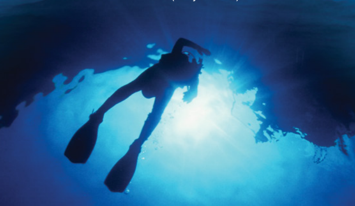
Image above: gray whale (Jan-Dirk Hansen) below: diver (Jerry Loomis)