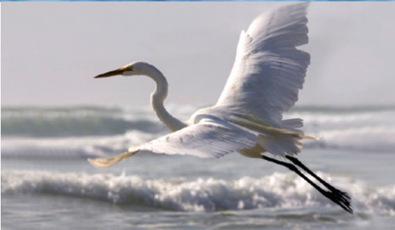
great egret