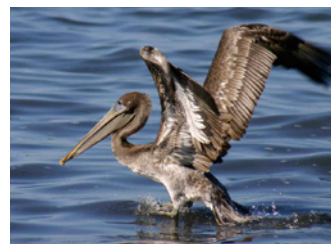
brown pelican