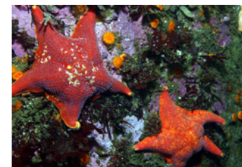
bat stars (Josh Pederson)