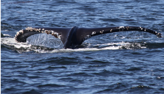
humpback whale (Chad King)