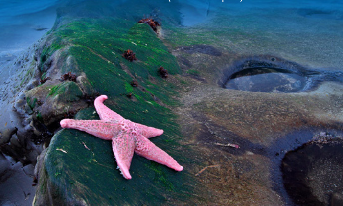
Image above: Schooner Gulch State Beach below: sea star

Offer recreational and economic opportunities