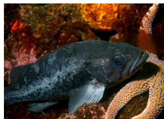
black rockfish (Steve Lonhart)