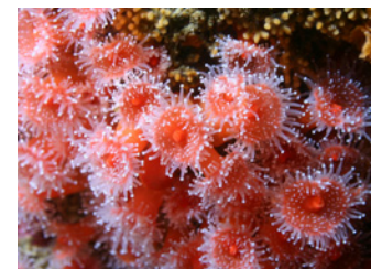
strawberry anemone (Chad King)