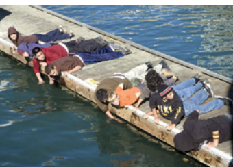
students learn (Ken Bondy)

For centuries indigenous people occupied the Central California coast, thriving on the rich marine resources. Today this special stretch of coast includes Hearst Castle® and popular elephant seal viewing sites. It is managed by the state to protect its rich resources and to provide enjoyment and inspiration for today's visitors and for future generations. Protecting this legacy is our greatest responsibility.