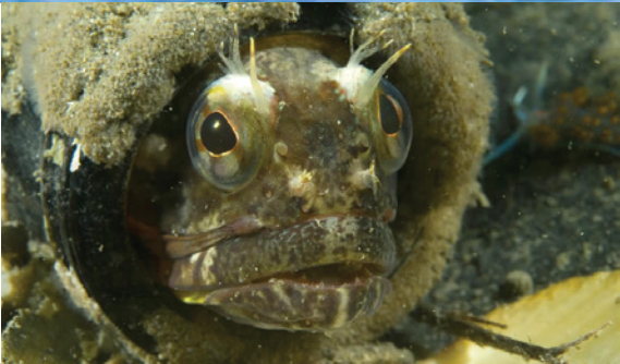
sarcastic fringehead fish (Ken Bondy)