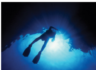
diver (Jerry Loomis)