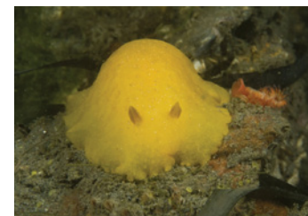
lemon nudibranch (Ken Bondy)