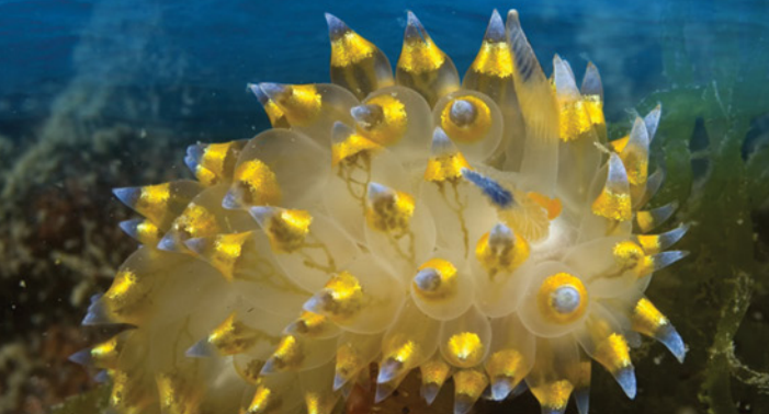
Image above: gray whale below: nudibranch

Offer recreational and economic opportunities