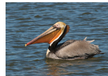
brown pelican