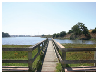
raised walkway (Becky Stamski)