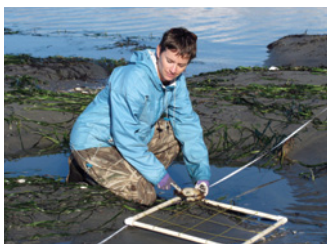
monitoring clams (ESNERR)