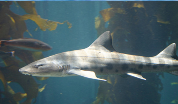
leopard shark (Chad King)