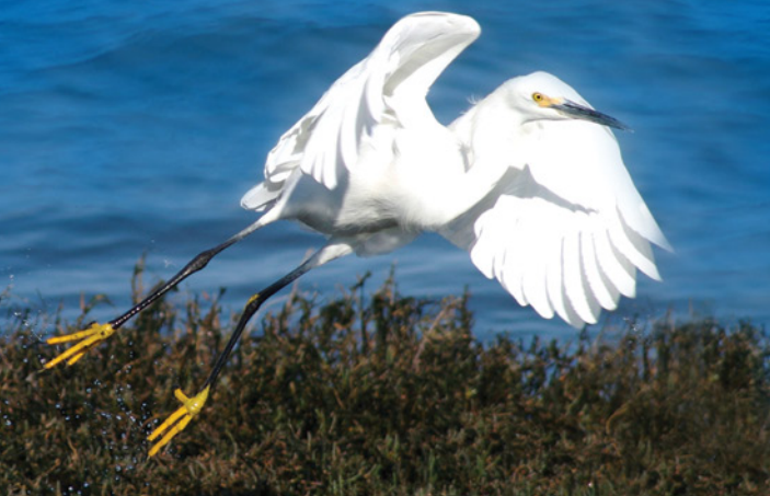
Image above: marbled godwit below: snowy egret

Offer recreational and economic opportunities