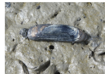
jackknife clam (Kerstin Wasson)