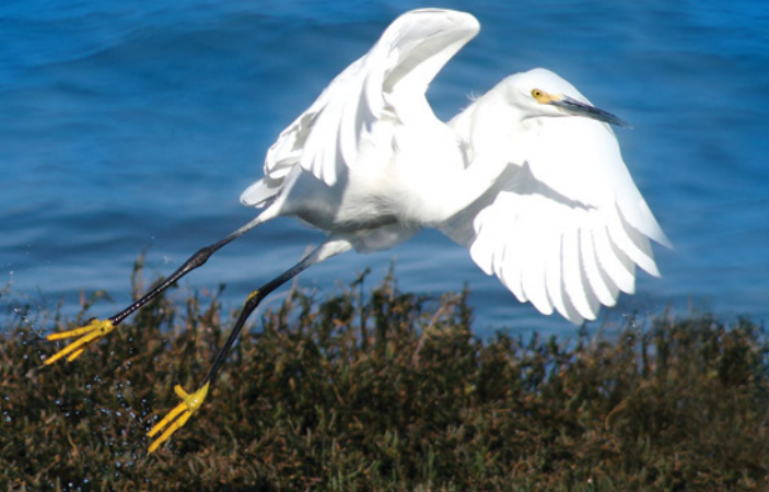
Image above: marbled godwit below: snowy egret

Offer recreational and economic opportunities